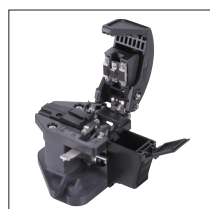
Table-top cleaver FC-5S