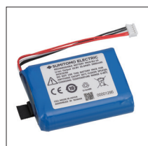
Battery pack BU-15