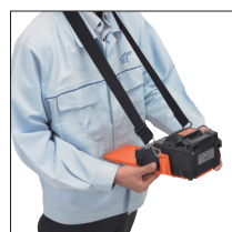
Work table WT-15