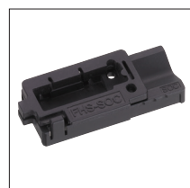
Connector holder FHS-SOC