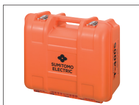
Carrying case CC-15