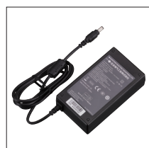
AC adapter ADC-15